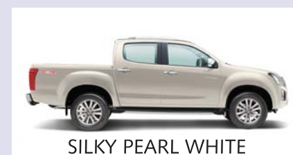
SILKY PEARL WHITE